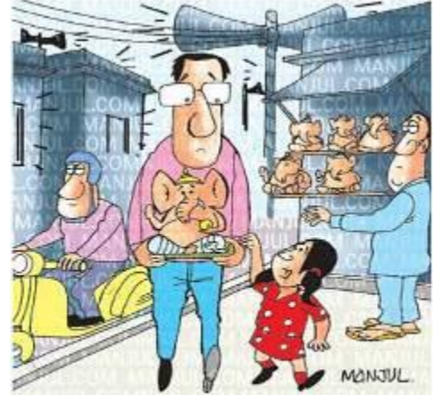
I'm sure loud noises can make him uncomfortable...he has such big ears