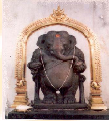
Gowri Matha and standing Ganesha (>1500 year old) at Idagunji, Uttara Kannada

O' Elephant God – Thou shall remove all Obstacles